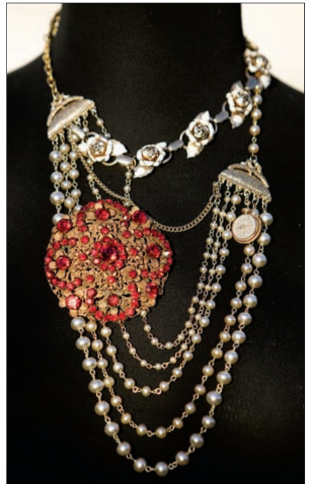
A Czechoslovakian brooch with more than 70 rhinestone sets, vintage pearls and a vintage gold tone with white enamel rose necklace make up this substantial piece. Far left, an intact 1930s heart brooch with multi-color rhinestones and pearls, semi-precious stones and rosary beads with a crystal drop create a divine look.

She works out of a spacious sunroom in the Mira